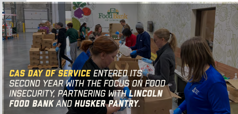
CAS DAY OF SERVICE ENTERED ITS SECOND YEAR WITH THE FOCUS ON FOOD INSECURITY, PARTNERING WITH LINCOLN FOOD BANK AND HUSKER PANTRY.

the early childhood mental health of Nebraska's young children by engaging with professionals through Early Childhood Mental Health (ECMH), Reflective Practice, and Court Infusion. NRPVYC trained 2,950 professionals in Early Childhood Mental Health and Reflective Practice in 2021.